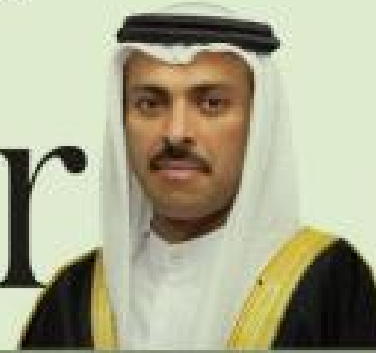
On the occasion of the Kingdom's 93rd National Day, Bahraini Minister of Information Ramzan Al-Nusami said relations between Bahrain and Saudi Arabia are witnessing continuous growth.